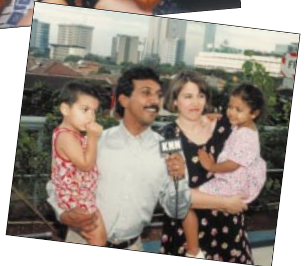
▲ Top photo: A group of disciples enjoy fellowship together, grateful to be a part of the church in Singapore.